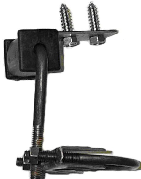
Front tail pipe hanger assembly